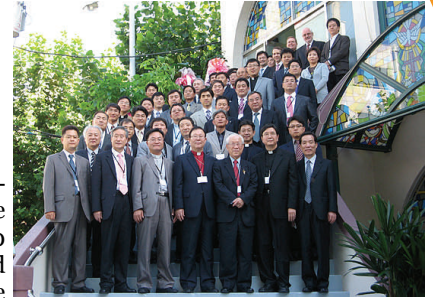
General assembly participants

In October and November LCMS World Mission personnel from St. Louis, Taiwan, and Hong Kong visited the Lutheran Church in Korea (LCK) to explore ways that the LCMS can share the resource of people to further the Ablaze! goal of sharing the Gospel. This can happen through volunteer missionaries, theological educators, and professional educators coming from the LCMS to work alongside LCK congregations and Luther University/