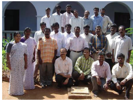
New Concordia Seminary graduates now serving as probationers-as-church planters

The twelve students in the informal seminary of the Lanka Lutheran Church will receive their ordination in