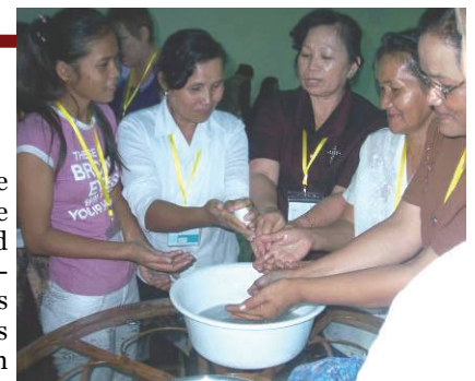
Ladies practice washing hands during a recent community health training.

It was exciting to see the women interact with each other, as many of them had never met prior to this workshop. They shared much