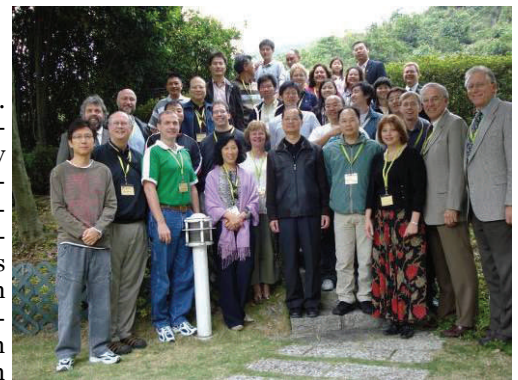
PLI Hong Kong training participants

"Very helpful" and "extremely practical!" "Now I know why I do the things I do." These were just some of the comments made at the end of this year's Pastoral Leadership Institute (PLI) International—Hong Kong training. The meeting, held in Shatin, New Territories, Nov 4-7 2007, included the second year Lutheran Church Hong Kong Synod PLI class (15 students) as well as a new first year class (6 students). Fall 2006 was the first year and so the expansion to a second year and plans for year three and four are a positive sign of the usefulness of the program. This year was also unique in that PLI Hong Kong added a new dimension of an LCMS