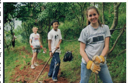
CISS students work on setting up a clean drinking water system as part of the Yunnan Education Project

For more details and photos from the Yunnan trip, including journal excerpts from Ms. Jen Hsu (one of the participants), visit the China Asia Ablaze! Extras - www.asiaablaze.org/extra.html