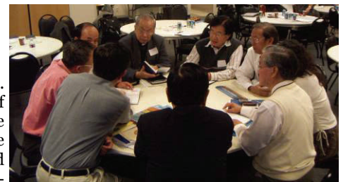
Participants at the recent Vietnam Summit in California