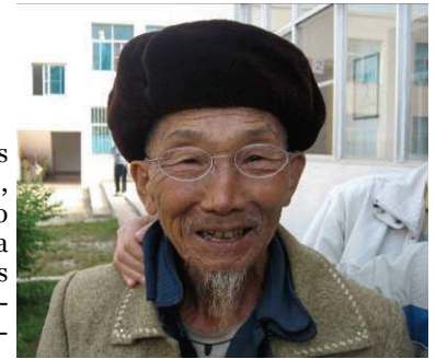
A villager shows off his new eyeglasses after attending a MOST Ministries eye clinic.

Because interpretation assistance was needed, LCMS long-term volunteer English teachers at Qujing Teacher's University arranged for their English major students to join the clinics and assist with interpreting. For many of these students, this was the first time they have taken part in a service activity. They loved the