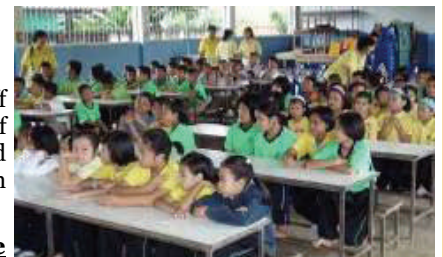
LCMS & CWEFT team members meet with school children on a recent trip to Northern Thailand

The children at the Concordia Daycare Center in Bang Na were treated to a special "Love & Fun Party" on Nov. 30, sponsored by a local German businessman. The daycare targets needy and at-risk children from the nearby slum community by providing child care through clothing, feeding, bathing, and educating children who have little else. On this particular day, things were blazing with God's love as they sang Christian songs and enjoyed special foods and friendships