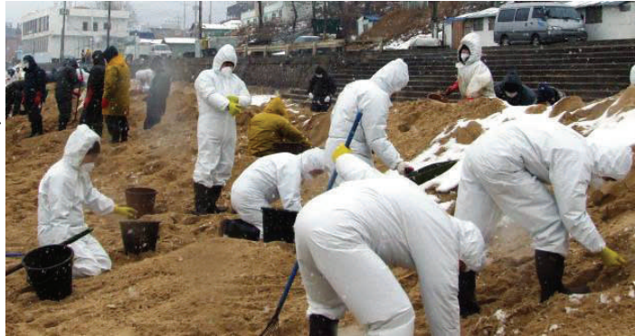
Korean pastors (in white) help with the clean-up after an oil spill in Korea's Yellow Sea

For 2008, the church plans an even more active mission program with three visits