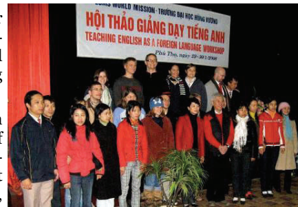
Teachers and students who participated in the recent “Teaching English as a Foreign Language Workshop” in Phu Tho, Vietnam

Pictures and video from the workshop can be found at the following web links: