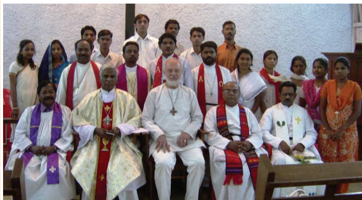
Participants and leaders at the recent urban church-planting course held in Mumbai, India

The People of the Book Lutheran Outreach and Children's Christian Concerns mission societies have joined with LCMS World Mission to start Lutheran schools in rural Bangladesh. The government has invited any organization to start schools in the country, so LCMS World Mission is responding to that open invitation.