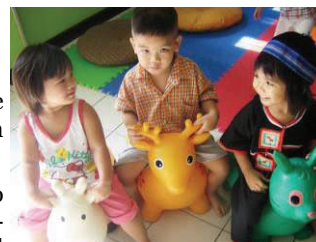
Children enjoy their time at the Concordia Child Care Ministry Prachachuen in suburban Bangkok

Through all of these positive developments in the past year, the child care ministry has been blessed with opportunities to share His love with the children. Each baby