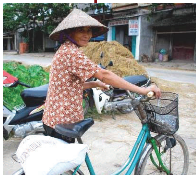
A flood relief recipient in Vietnam heads home with her rice.