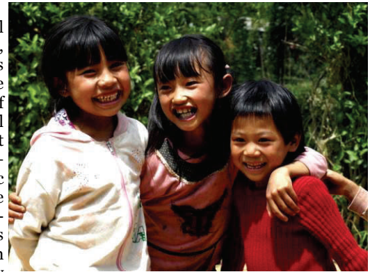
Children in Tuanshan Village where CISS students spent a week helping to install a freshwater drinking system