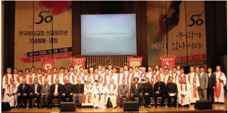
Lutheran leaders attend the 50th Anniversary of the Lutheran Mission in Korea celebration in Seoul this past October.