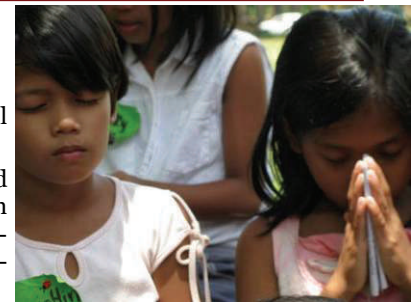
Children pray at a recent VBS event held in Buru-un Iligan City.

On May 5-10, Holy Trinity Lutheran Catholic Church (HTLCC) in Linamon Lanao del Norte held its VBS at four