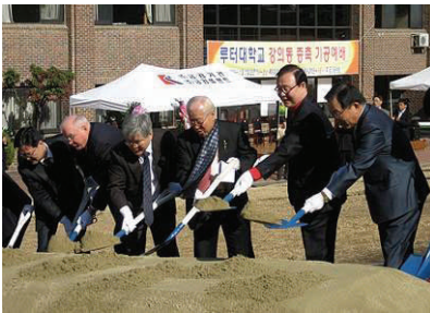
Ground is broken on Nov. 11 for a new LTU building.