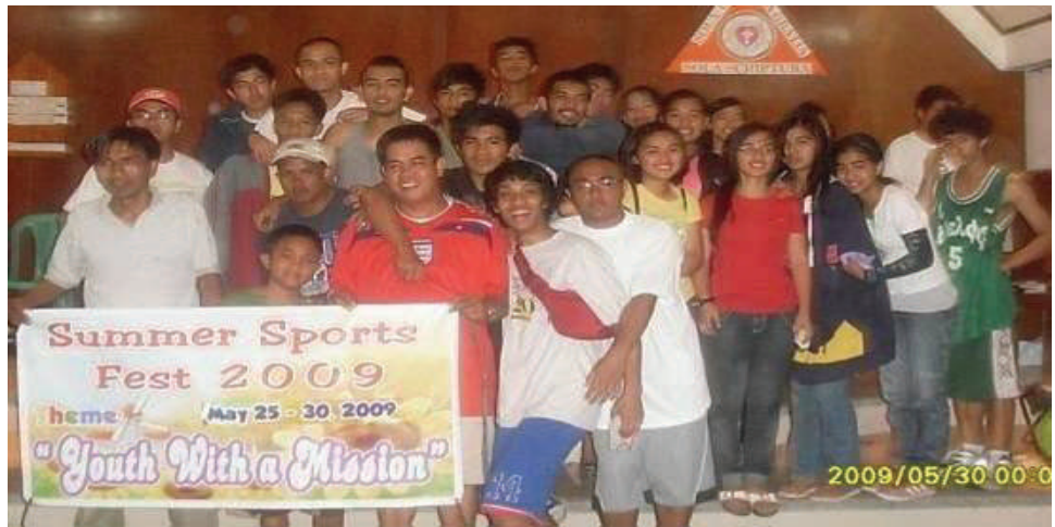
Participants in the recent Sports Fest