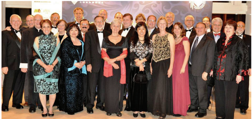
CISS founding faculty and supporters

Faculty and friends gathered again midday on Sunday, April 26, at CISS for a potluck brunch. The brunch was a great chance for old friends to catch up in an informal setting, and many were still in