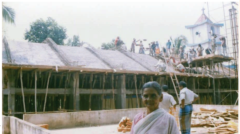
One of many chapels being rebuilt in India to accommodate the rapid expansion of congregations there