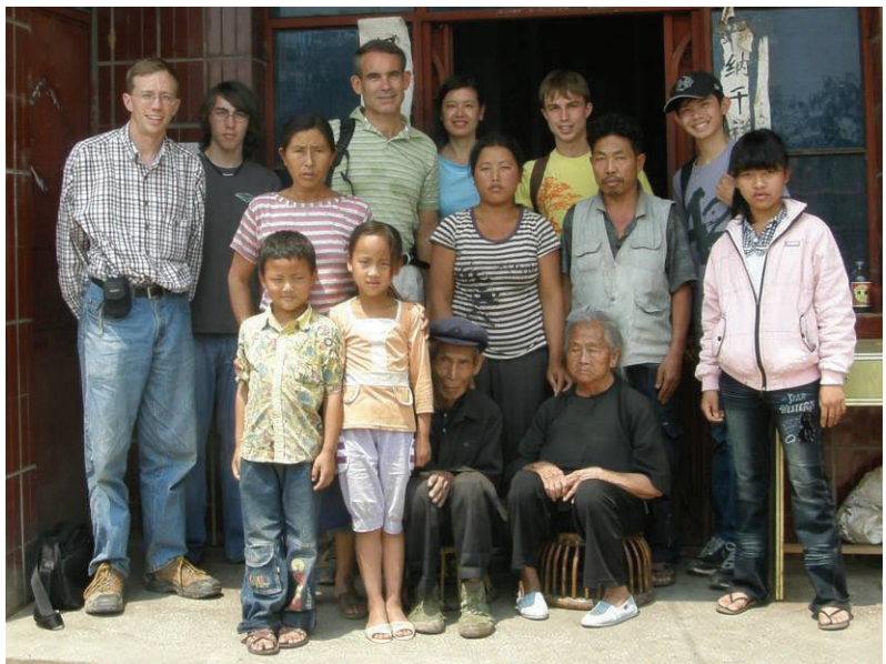
CAN team members with a village family

The service element of the trip was to help CWEF do water project follow-up in four villages where CWEF had helped to provide fresh water in the last 6 to 18 months. The team was to gather information on the impact fresh water was having on the people in the village, to understand how life was improving for them, how they were using the water, and what else should be done. They were also there to help provide additional hygiene training.