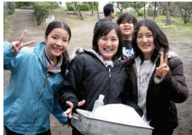
Participants at the recent NRK Youth Camp

From March 31 to April 2, the Japanese Lutheran Church (NRK) held its first Junior-Senior High Youth Camp for those in the Tokyo area, and six energetic teens were able to attend. The camp theme was "de ai" which means "an encounter." One goal was for the youth from various churches to encounter other youth, and spend time with teens who also