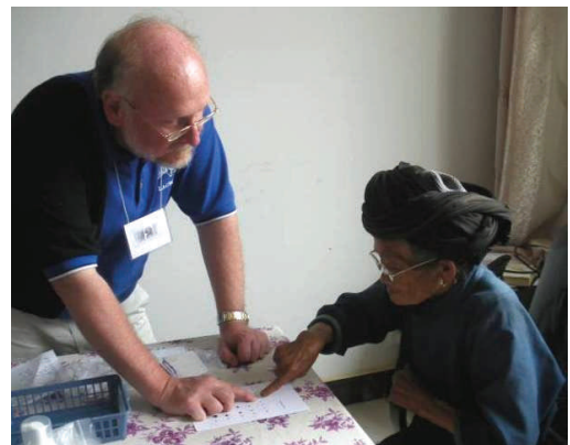
A MOST team member examines a local woman at a recent eyeglass clinic.