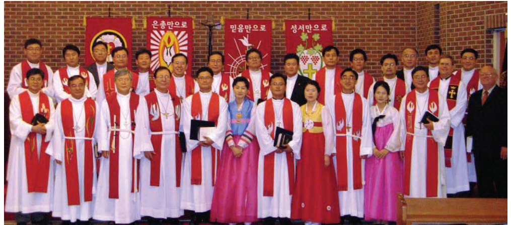
Ordination of new Lutheran pastors

The 2009 Korea Pastoral Leadership Institute (PLI) Conference and PLI Graduation took place from May 26-29, with 18 pastors and 13 spouses graduating. PLI, a non-profit organization founded for the improvement of pastoral leadership, is comprised primarily of LCMS pastors and their spouses, but is also now equipping pastors internationally. In 2001, the American PLI and the General Assembly of the LCK began working together through annual conferences aimed at improving the pastoral leadership of LCK pastors and their spouses. At this year's conference, pastor couples that have received PLI training in the past eight years received graduation papers and certificates for their