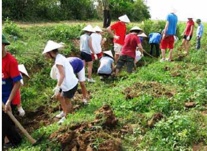
Team members from the Seoul Foreign School work to dig an irrigation ditch on a recent service trip to Vietnam.

The group spent the last afternoon in Dieu Luong visiting the communal health station and several families, some of whom have received cows through the LCMS World Mission Cow Project. This gave the students a deeper understanding of how people in a developing country like Vietnam live and work. Team members saw firsthand how access to opportunities and resources like education and healthcare, while often taken for granted at home, are things others may have limited access to. In one of the visits, SFS students met with a family who received a cow from LCMS but had to sell the mother cow and her calf (after having paid back the loan), to pay for the father's hospital expenses. The students were inspired to do some fundraising to buy this family a replacement cow. With a family whose annual income ranges from US$ 60-110, a cow, which costs about US$400 USD and