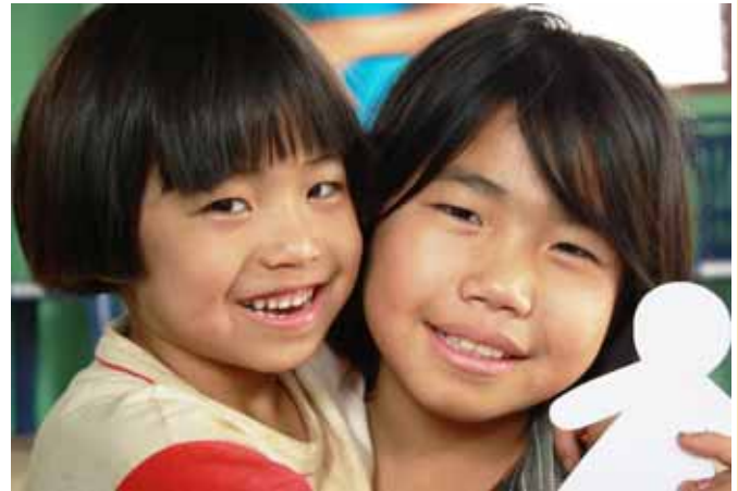
Two young Akha girls at a recent youth camp in Thailand.

This past April the Thailand Concordia Lutheran Church (TCLC) hosted a four-day seminar for its leaders and partners. The seminar gave the participants the opportunity to become familiar with one another's ministries and identify ways to support and uplift one another as they serve in re-