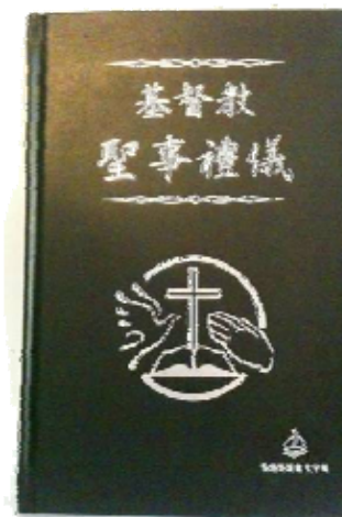
The new "Agenda for Christian Liturgy" in traditional Chinese.

The book is bound in genuine Italian lamb skin and is available now for HK$400 (US$50) per copy. For more information, contact the LCHKS Literature Department at info@hkcpshk .