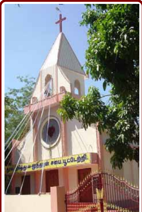
Many congregations of the India Evangelical Lutheran Church have outgrown their facilities. The members are giving sacrificially to build chapels like the one above that bring the glory and message of Christ to their communities.