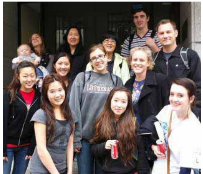
Team members from Orange Lutheran Church in Orange, California on a recent service trip to Korea