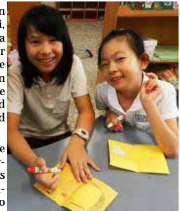
Third grade CELA students work on their cards for victims of the tornado in Joplin, Missouri