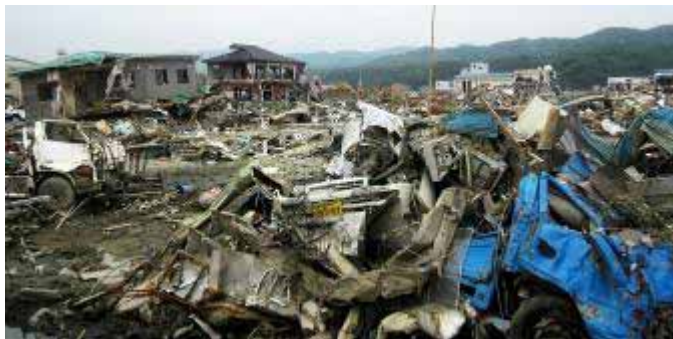
Damage caused by the earthquake and tsunami which devastated Japan on March 11, 2011