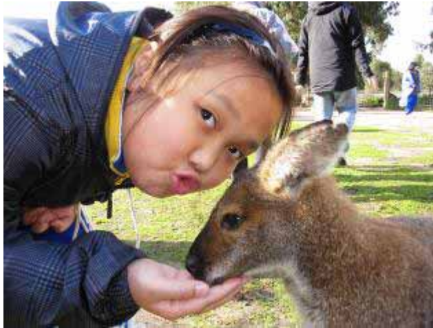
A Hong Kong student on a recent trip to Australia as part of the Australia–Hong Kong cultural exchange program

HTLS and LSL students spent time together in school during the week. The HTLS students and chaperones led English lessons about Australia which prompted English conversation among the LSL students, while also giving HTSL students an opportunity to become leaders and share exciting things from a different