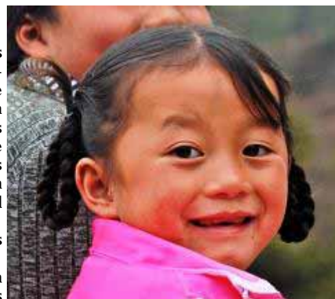
A young girl in one of the villages visited by LCMS team members

200 students enjoying popsicles in the hot sun on CISS’s sports field. The day was packed with learning and language practice as students shared with their partners about their families, asked questions about their lives, and laughed their way through the challenges presented by overcoming communication barriers. The day’s physical activities included a wheelbarrow race and Frisbee, as well as games of kickball and basketball. Play is understood across all languages and the students cheered