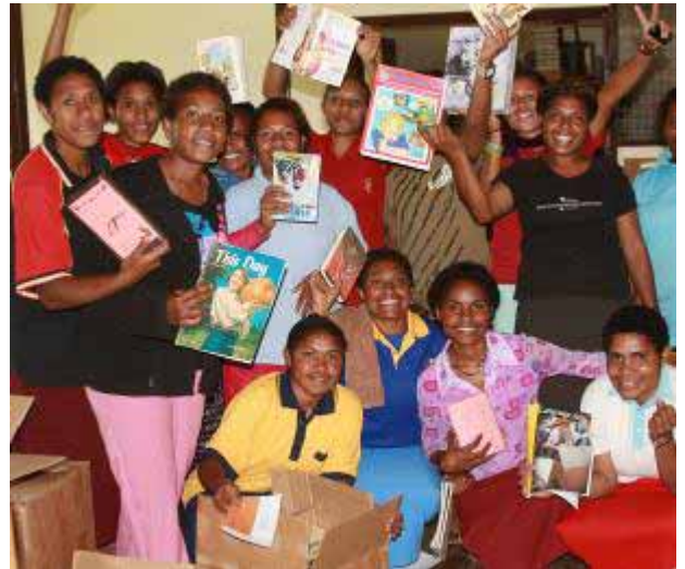
Students in Papua New Guinea were very excited to receive tens of thousands of new books

Because education in PNG is done in English, the donated books can be used easily by the students and teachers and incorporated directly into the curriculum. In addition to the information contained in the books, they also will provide good reading practice for the students. Due to the lack of