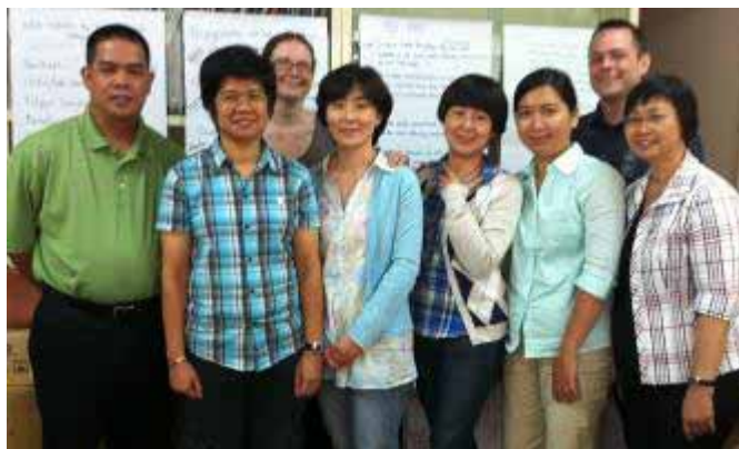
Participants at the recent LCMS Asia Community Health Education/Evangelism (CHE) meeting in Hong Kong

Ten congregations of the Lutheran Church-Hong Kong Synod joined together for a