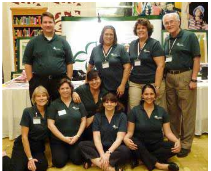
Concordia International School Hanoi administrators, teachers, and staff

At CISH, service learning will be a big part of the curriculum. Students will spend time working in the Vietnamese community where they live and assisting with some of the LCMS WM aid projects throughout the country.