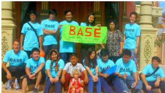
BASE team members from SPH School in Jakarta on the recent service trip to Banda Aceh

The doors the Lord opened for the BASE team led to amazing experiences, which included English lessons in and out of the classrooms, and an opportunity to perform a drama in front of the whole student body at two separate middle schools. This drama included a message centered on an-