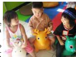
Children enjoy their time at the Concordia Child Care Ministry Prachachuen in suburban Bangkok

Through all of these positive developments in the past year, the child care ministry has been blessed with opportunities to share His love with the children. Each baby