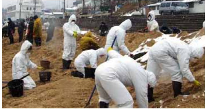
Korean pastors (in white) help with the clean-up after an oil spill in Korea's Yellow Sea

For 2008, the church plans an even more active mission program with three visits