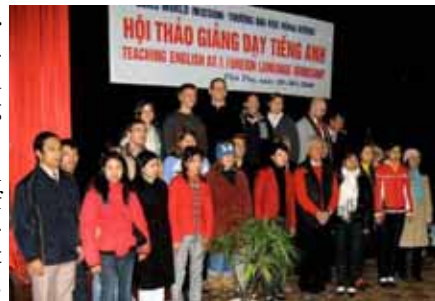
Teachers and students who participated in the recent “Teaching English as a Foreign Language Workshop” in Phu Tho, Vietnam

Pictures and video from the workshop can be found at the following web links: