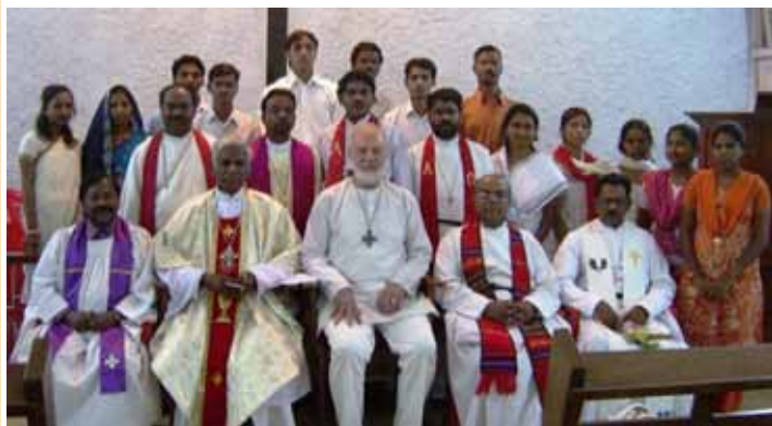
Participants and leaders at the recent urban church-planting course held in Mumbai, India

The People of the Book Lutheran Outreach and Children's Christian Concerns mission societies have joined with LCMS World Mission to start Lutheran schools in rural Bangladesh. The government has invited any organization to start schools in the country, so LCMS World Mission is responding to that open invitation.